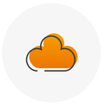
Cloud (internet browser)