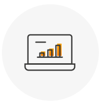
Stand alone (customer's infrastructure)